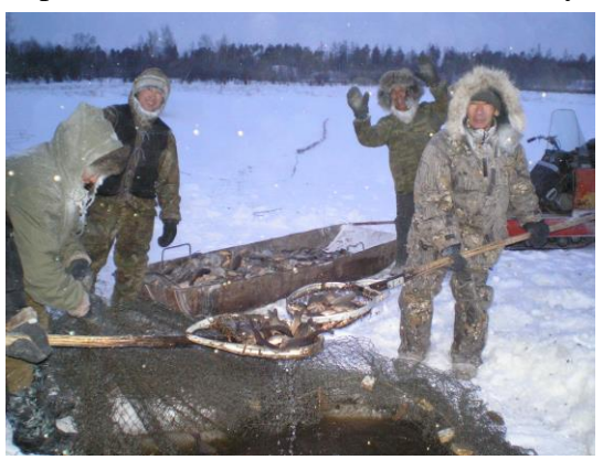
Traditional winter seine fishing in Yakutia (Russia)

In some Arctic regions the term local ecological knowledge is often used. Traditional or local knowledge systems can be divided into several interrelated components. Central to this is local knowledge of resources and resource management systems including practices, tools and techniques. Often this includes knowledge of social institutions ("rules-in-use"), principles of social relations and a worldview enriched by the concepts of religion, ethics and broader belief systems. For many Indigenous populations customary practices and a profound sense of the sacred fill everyday life.